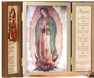
Our Lady of Guadalupe Traveling Shrine

the pro-life movement, understanding the fundamental importance of the issue, as well as the fact that 1/3 of my peers had been exterminated, I felt a responsibility toward those who are in such grave danger. So when looking for a community, I believed that God, Who put so much training and effort in to teaching and training me, would not have formed me in this way without an opportunity to use these skills. When I came to visit the sisters at their Franciscan Experience, the sisters were all very welcoming, helpful and patient. I felt I could be myself and didn't need to fit in to some kind of "mold." I also experienced a great sense of peace, which I had not found anywhere else. I really love being a Franciscan Daughter of Mary! Our whole way of living is focused on God, and we are always talking about how to become holier and more like Christ. We pray for one another and help each other to get to Heaven.