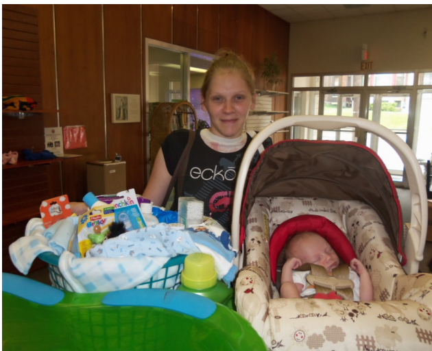
A family grateful for donations.