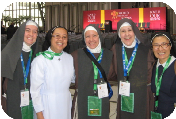
The Sisters with sisters at the World Meeting of families

"A society grows stronger and better, it grows in beauty and it grows in