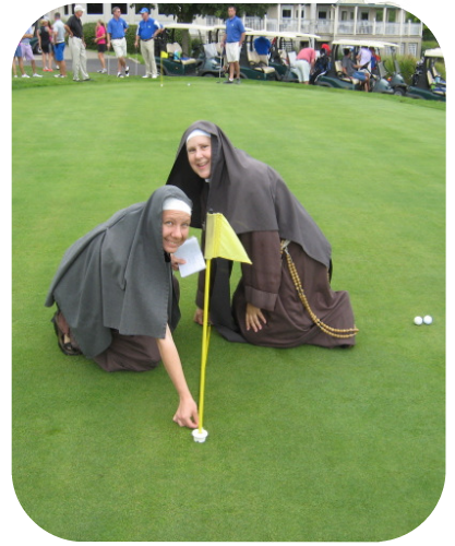
Checking it twice