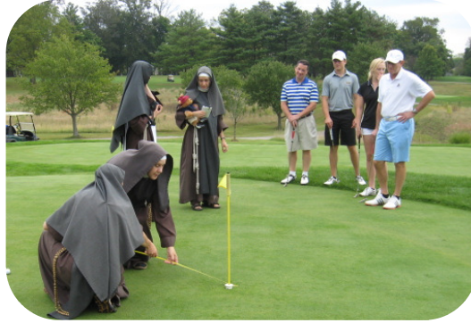
The sisters got to judge the putting contest