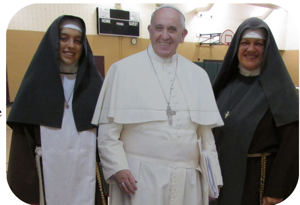
Mother & Sister with a life-sized likeness of Pope Francis in DC