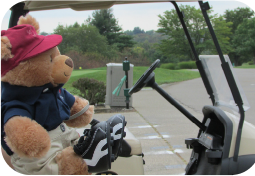
The cutest little golfer on the course!