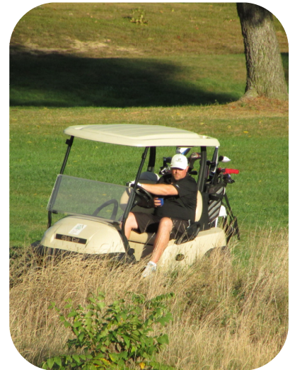
Anyone see a white ball?