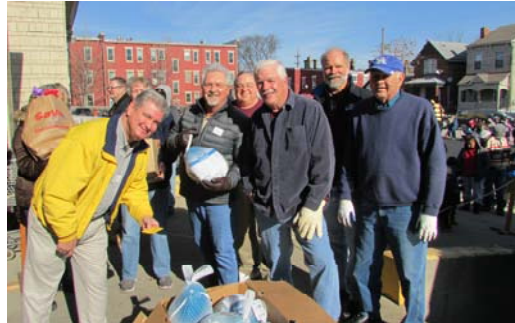
Good friends and volunteers give turkeys to our neighbors at the Thanksgiving Give-Away.