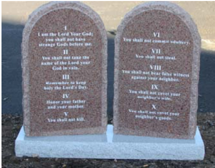
The 10 Commandments - gift of a friend - sit in our outside Rose Garden that faces Madison Ave..

553 Families received Ham or Turkey for Christmas