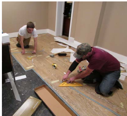
A new floor for the Dental Clinic