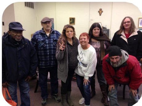
Smoking Cessation Class