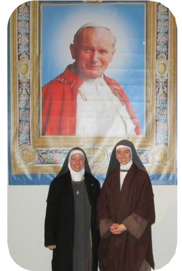
The sisters made a visit to the Shrine dedicated to St. John Paul II, Washington, DC