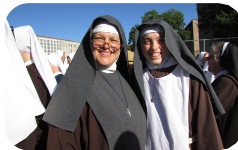
In Washington, DC at the CMSWR sponsored trip for Religious to attend the Papal Mass