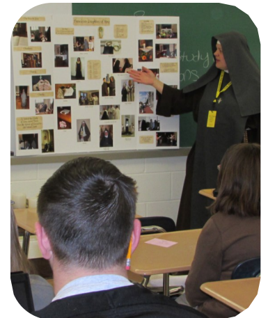
Mother shares what life is like as a Franciscan Daughter of Mary at one of many High Schools we spoke to last year