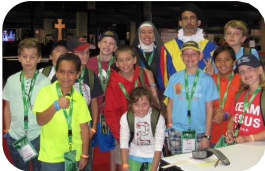
The Sisters volunteered to lead groups of young people at the World Meeting of Families in Philadelphia