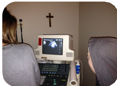
Our first ultrasound