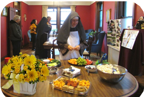
Sister prepares some hospitality for guests at the Open House for the Year of Consecrated Life at our convent