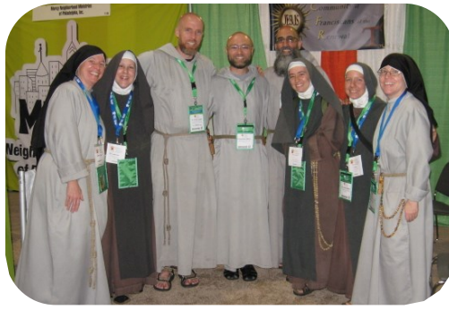
The sisters met our good friends the Friars and Sisters of the Renewal while volunteering for the World Meeting of Families in Philly