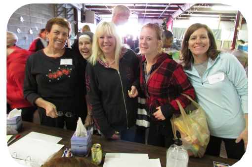
Our Helpers love to serve our neighbors