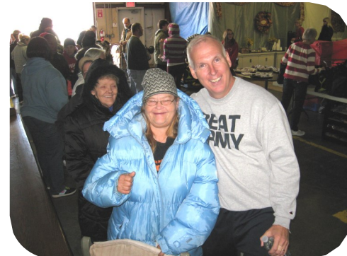
Serving our neighbors with a smile