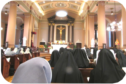
Sitting with hundreds of sisters from religious communities throughout the country at the CMSWR Symposium on Religious Life