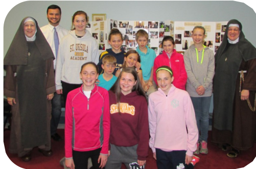
Guardian Angels Youth Group, Cincinnati, treated the sisters to dinner and a play (The Sound of Music) in honor of the Year for Consecrated Life