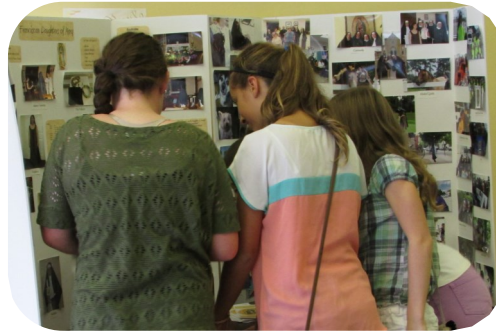
Our young friends look at pictures of the sisters at our Days With Religious at the Mission