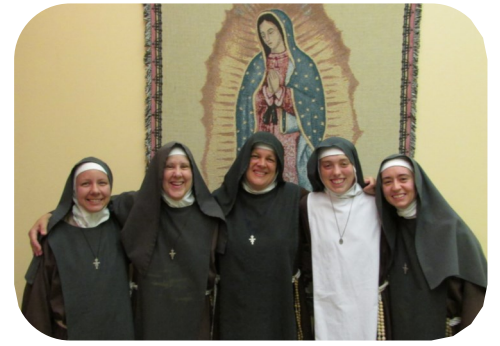
New community photo for the Year of Consecrated Life