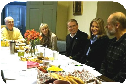
Board members express their gratitude to Heritage Bank representatives

As mentioned on the front page of this newsletter, the Friends of the Rose Garden are so grateful to the Berning Family Foundation for their generous contribution of $210,000! We praise Our Good Lord for the hundreds of other donations from "Friends" like you who have been so generous over these past 4 ½ years. As a result, the remainder of the bank note has been paid off!! Heritage Bank must also be recognized for their continuing assistance and cooperation during this time, for they gave us a loan when no one else would.