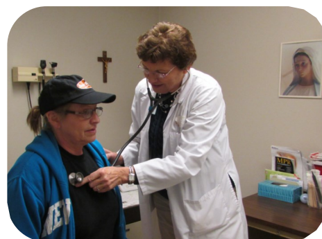
Taking great care with every patient