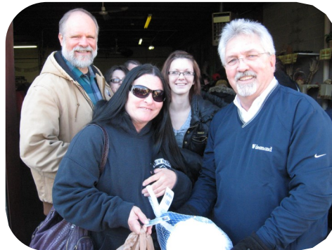
Helping our neighbors with turkeys