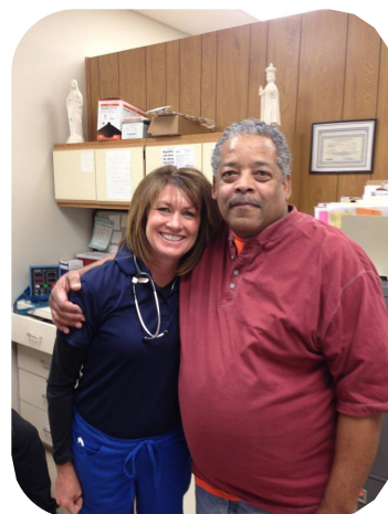
Hugs from a patient and a friend