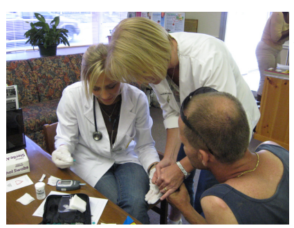
Working side-by-side to care for this neighbor

However, we really do more than that. Many Tuesdays the Spirit of God is so present in the Health Ministry Consultation Room, that it is almost palpable in the air. At those times, from one to five health care professionals are engaged with new friends who are in physical, medical or spiritual need. Our one-on-one policy