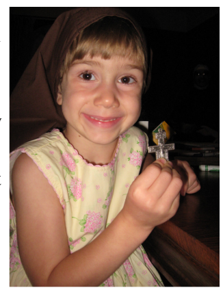
This Young Adorer loves her new Decade Rosary

Gospel events and parables. The girls were very knowledgeable about each of the scenes. The young ladies and the sisters truly enjoyed the day.