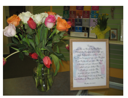
Matthew 25 ~ "I was hungry and you gave me to eat..."

When we began to offer health screenings weekly in October of 2009, our dream of opening up a free medical clinic for the uninsured was quickly becoming a reality. The one thing that presented itself as an obstacle was that our Mission on 18<sup>th</sup> & Madison was even too small for the aid that we provided for local friends and neighbors, much less was the prospect of adding exam rooms for a medical clinic. Needless to say, we began to look for other locations in Covington to do this.