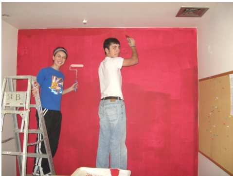
The perpetual debate—which is better, paint brush or roller?