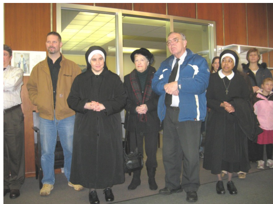
Some of our friends join us for the Blessing of the Mission

"When I first walked in this place I could feel God's love pouring out. I felt loved and knew God was going to provide for me. I needed that! I felt there was hope for my family."