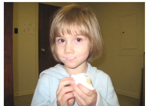
This young “Helper” takes a donut break