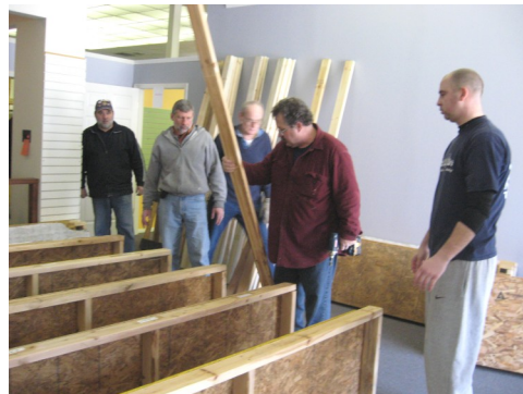
What do you mean we have left over lumber?