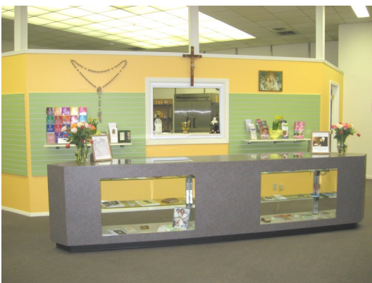
The Reception area at our new Mission. In the display case we have donated holy cards, medals and prayer books for our friends

At the new Mission, which is just two blocks further south on Madison Avenue from our prior location, we are better able to help our neighbors in need due to the extra room (it is significantly larger), abundant parking and off the street drop-off site for donations. Having a larger area to welcome our friends and neighbors was always