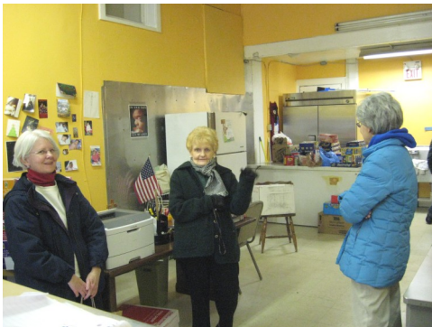
Three most helpful & faithful “Helpers” assist in getting the old place ready for the move

The above quote by Mother Teresa of Calcutta was never truer for the Franciscan Daughters of Mary than when we moved our Mission. The Lord sent so many “Angels” to help us clean, move, set up and plan the Open House that at one point there were almost too many! Almost! And so many Daughters Helpers and friends joined us for this blessed event.