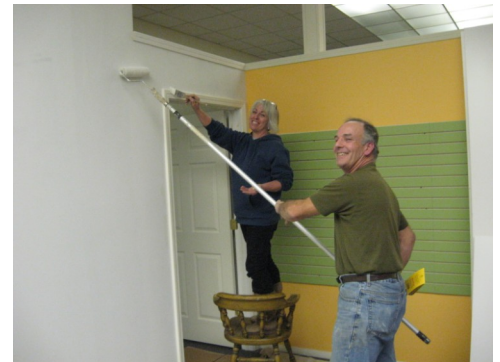
So beautiful when two can work as one