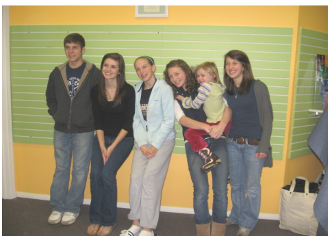
Very faithful & faith-filled Daughter’s Helpers