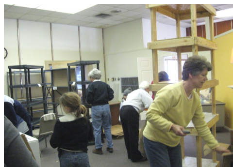
Many hands make light work