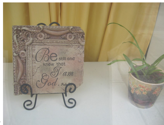
We have Scripture quotes in the windows facing Madison Avenue