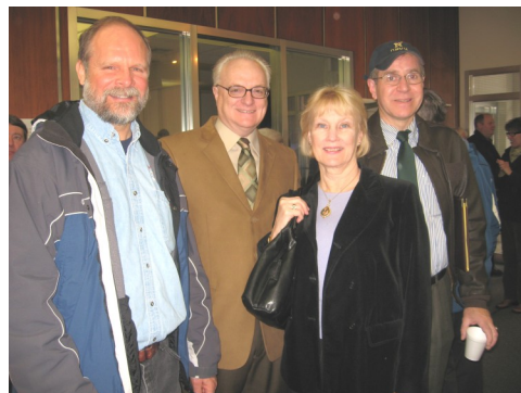
The initial 4 board members of the Friends of the Rose Garden Mission