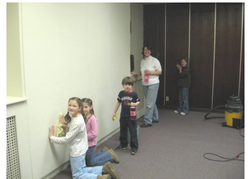
We’re very serious about cleaning—even the walls get cleaned!