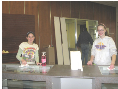
The glass is so clean I can see myself!