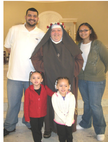
Sister’s children and grandchildren share in her joy

That whole morning it seemed like I couldn’t sit still. Then, when I walked in to the church, the nervousness finally went away. As I walked up toward the sanctuary to profess my vows, I felt like I was walking in to Heaven.”