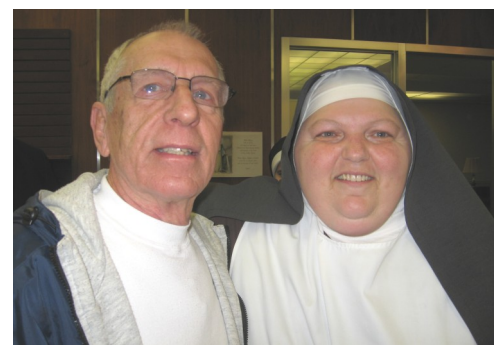
This Friend can fix anything!